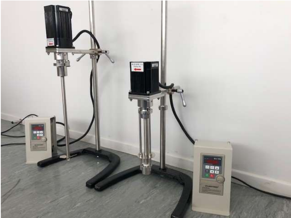
One each of the 200W and 370W units.

Delivery time for new units is 3-4 weeks.