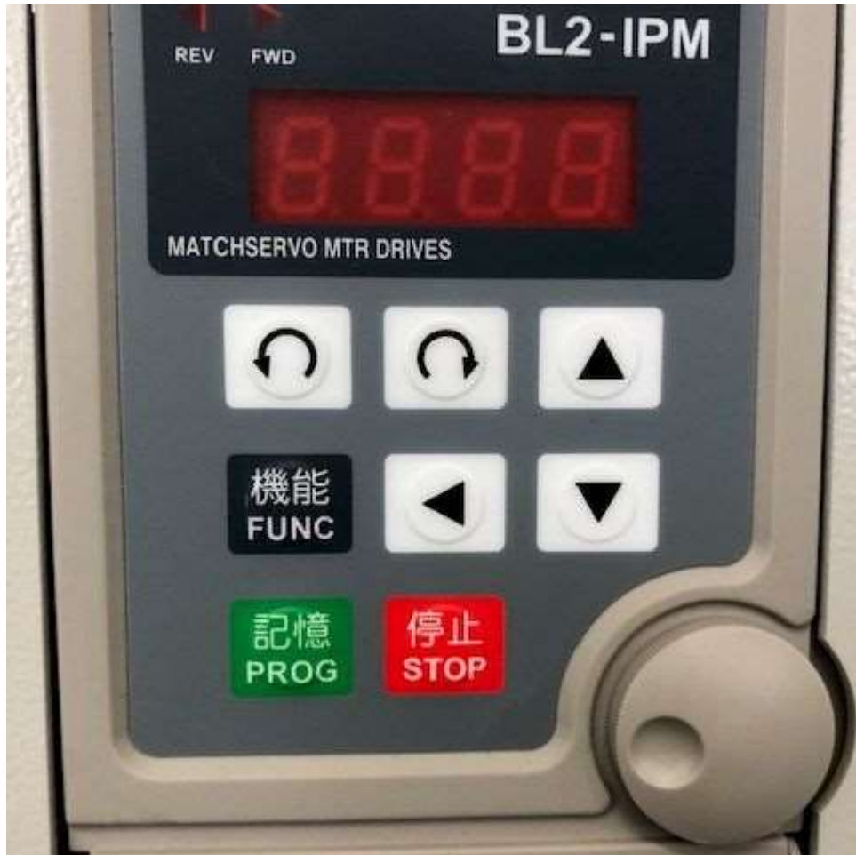
Single phase DC motor controller.

For more information or to arrange a demo contact us now on 09 828 3706 or by replying to this email.